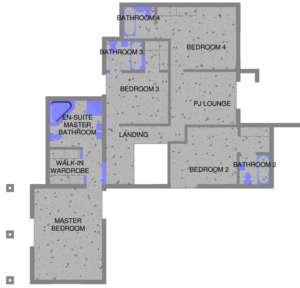
1 GROUND FLOOR - Demolition 1 : 150